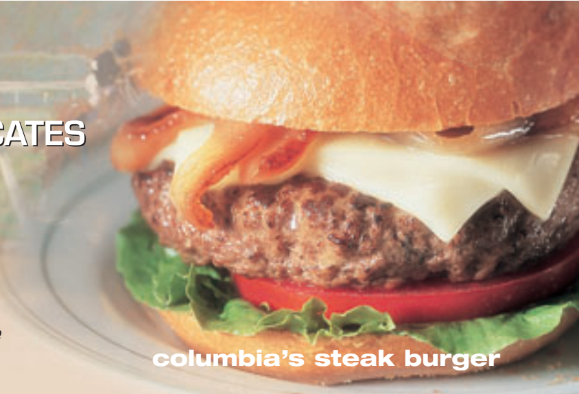
columbia's steak burger

Add a Garden, Caesar or Diego Salad 1.99 extra