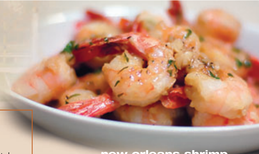
new orleans shrimp