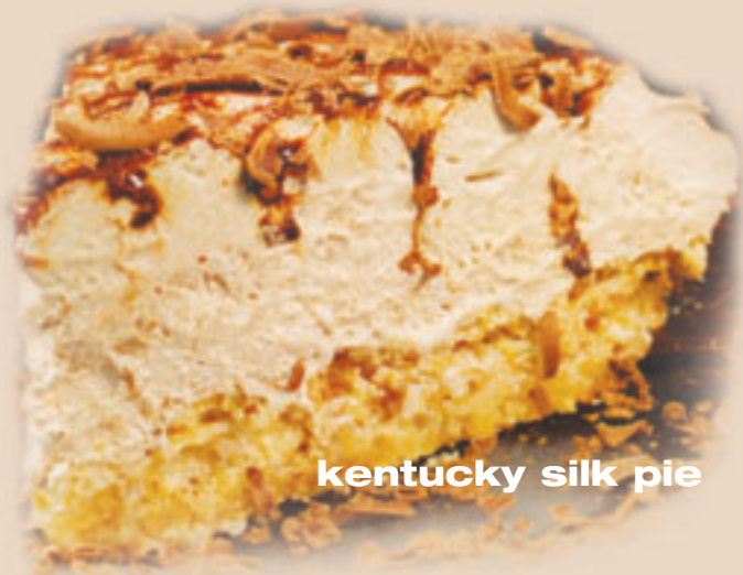
kentucky silk pie

Barbecue, Buffalo or hot sauce available upon request