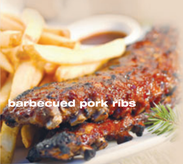
barbecued pork ribs

Always fresh, never frozen. Dipped in our specially seasoned batter and flash-fried. Prepared Buffalo-style, if you like. 9.99