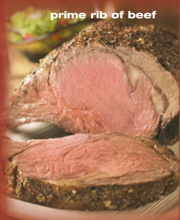
prime rib of beef

✦ Rubbed with herbs and spices, slow-roasted for tenderness and flavor. Fourteen ounces cut to your request and served with au jus and horseradish sauce 18.99