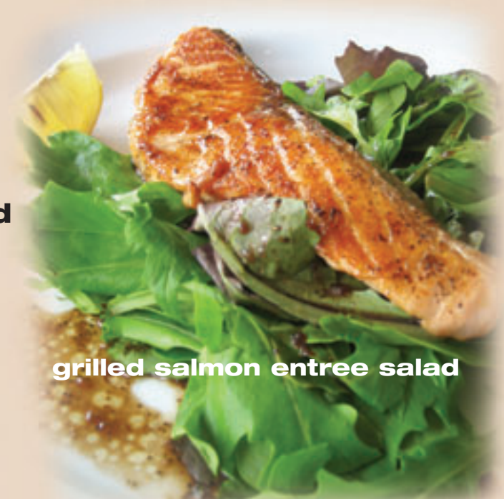
grilled salmon entree salad